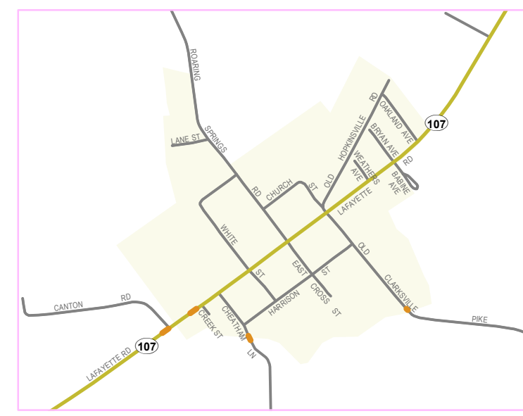
LAFAYETTE 1,250 625 0 1,250 2,500 Feet